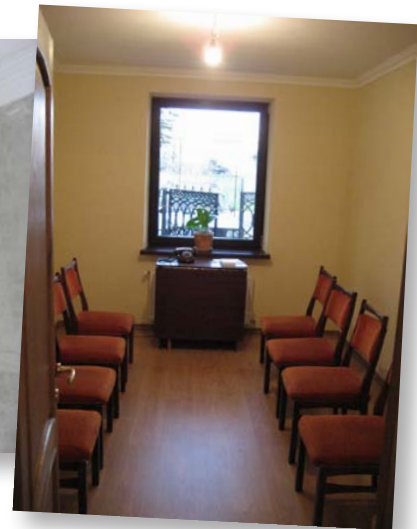
Nikopol Church Reno

In addition to the renovations at the Nikopol Church we have been working on the beginning phase of the Church renovation project in Chkalovo (project adopted by Simple Churches, Canada). Please pray for these project as we've stated to wear down a bit (I think we are just getting older ☺).