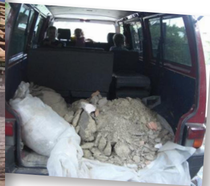
Chkalovo Church Reno