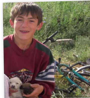
Playing outside the orphanage.