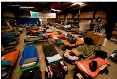
Camp Katrina volunteer quarters