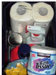
Cleaning items collected at Shekinah