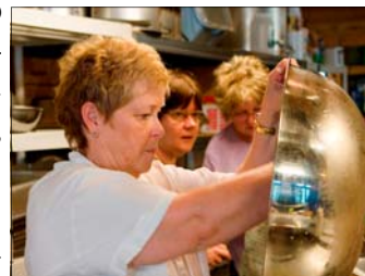
HFL team serving in Camp Katrina kitchen

After several months, the camp shifted focus, becoming a base for volunteers participating in cleanup and rebuilding.