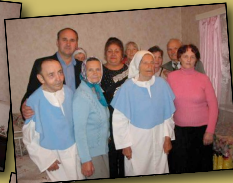
People who came to hear the Word of God before the baptisms