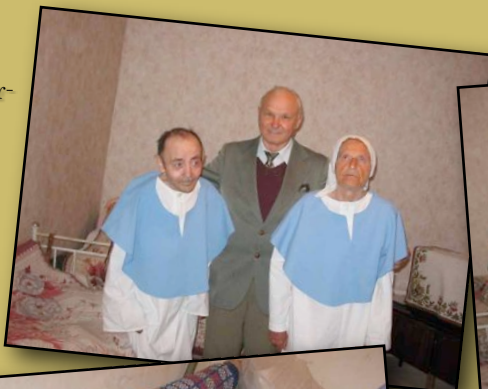
Baptisms in Krasnogrigrorivka, 2006

Once again we want to thank you for helping small churches in our area to grow and do God's work here. May God richly bless you in the ministry you are doing here in the Ukraine and in other places.