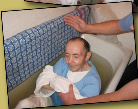
Baptism in the tub... this man is an invalid