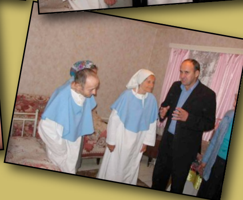
Fellowship with those getting baptized. This lady is 80 yrs. old and totally blind.